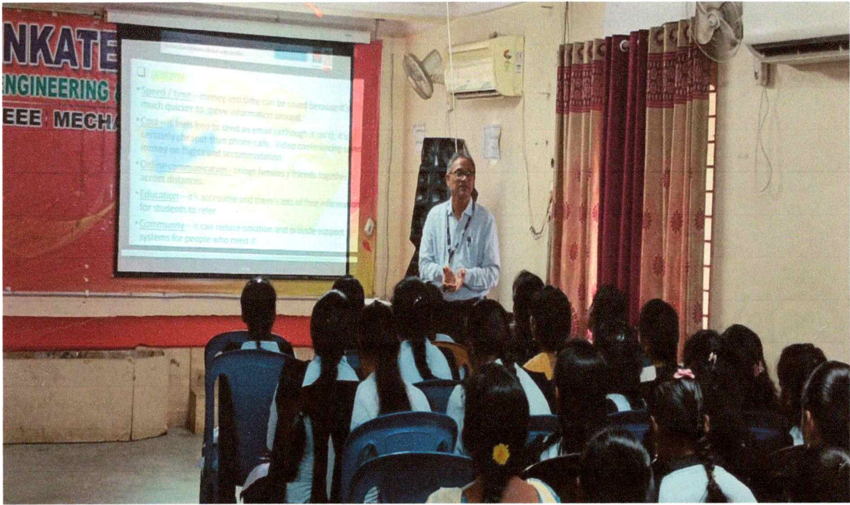
Training program on communicating with confidence