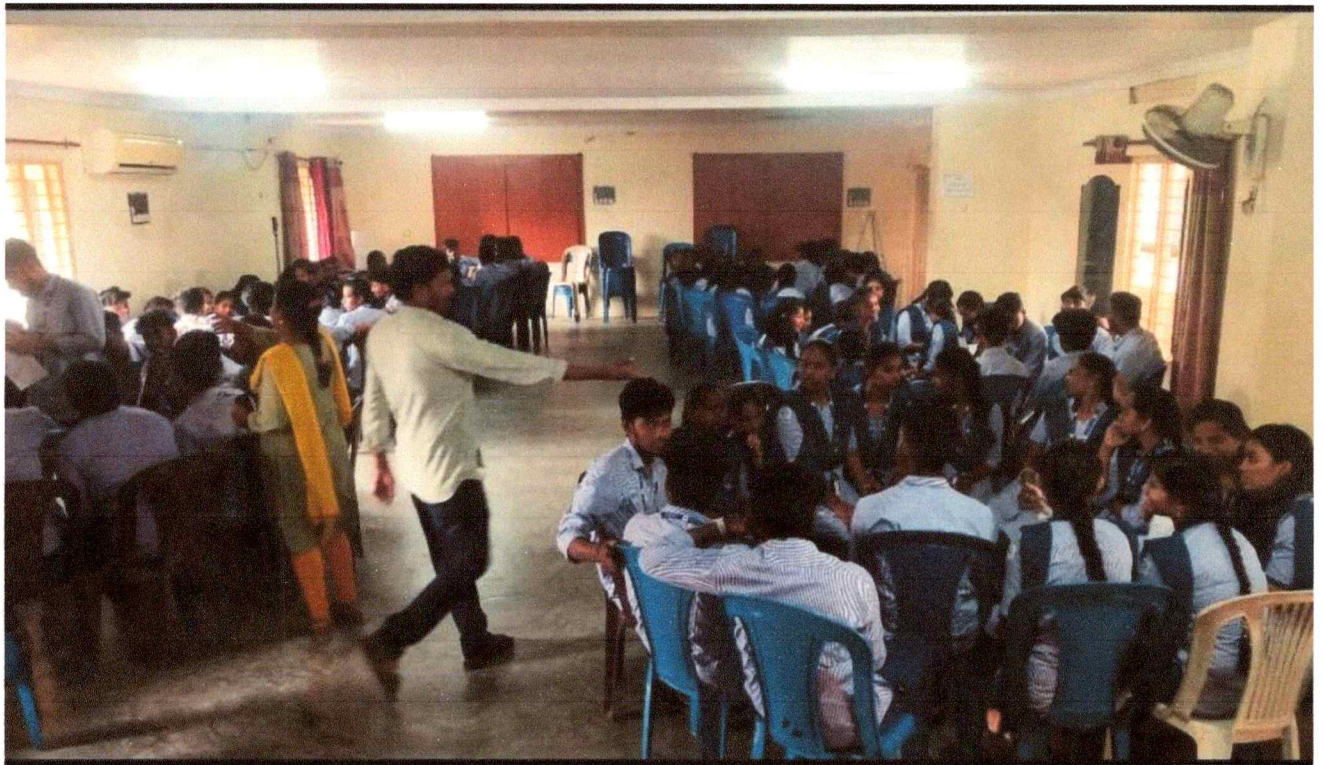
Training program on Role play and Conversation Practice