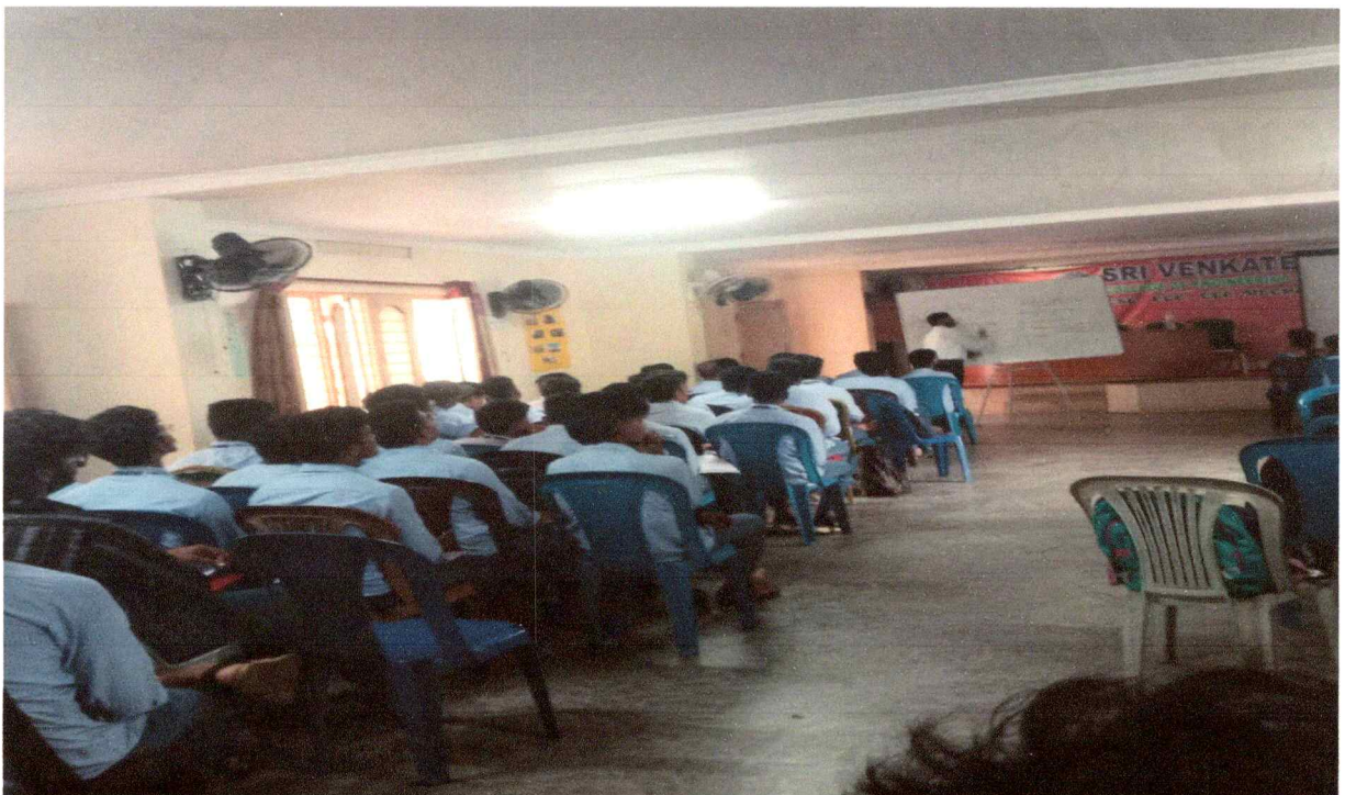
Training program on Importance of Communicative language in day to day life