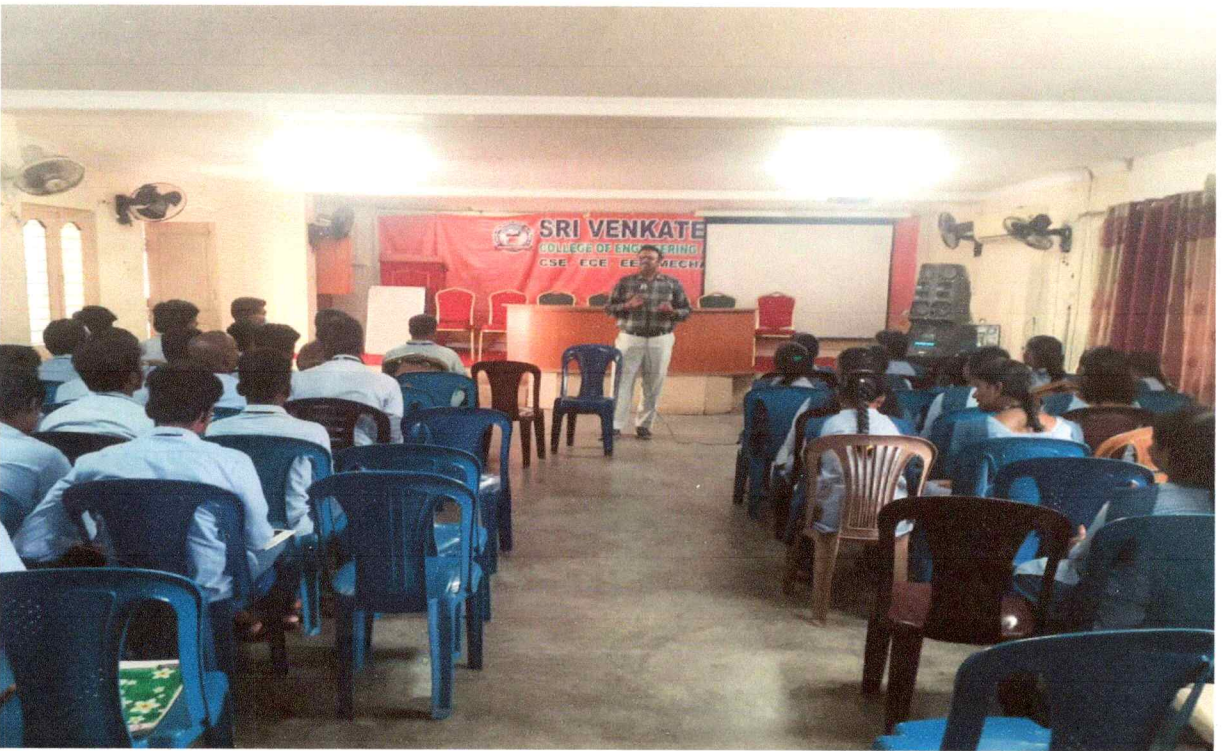
Training Program on JAM, Debate and GD